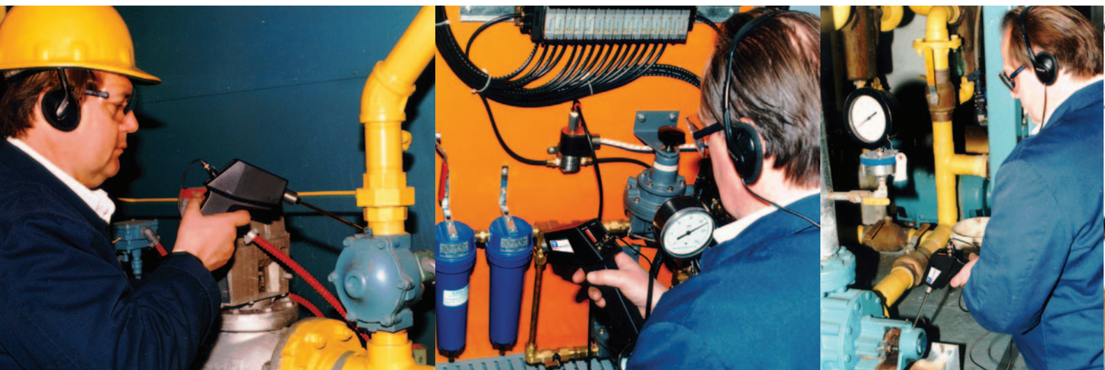
Left to right: Valve Leakage, Pressure / Vacuum Leaks, Mechanical Inspection and Tank Leakage.

General mechanical inspection of pumps, motors, compressors, gears and gear boxes: All types of operating equipment may be inspected with the Inspector 400. Since